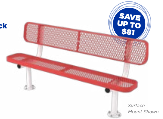
Surface Mount Shown

Mounting Options: Portable, Surface, In-ground